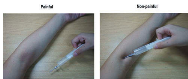
Figure 1. Illustration of a painful and a non-painful stimulus used in the current study.

Participants were presented with images of others' hands receiving painful and non-painful stimuli while an electroencephalogram (EEG) was recorded. There were 9 blocks of 80 trials for each participant. After reading one essay, EEG was recorded during three blocks of trials. The order of reading essays for independent, interdependent, and control priming was counterbalanced across participants. Each block started with the presentation of instructions for 3 s followed by 80 trials. On each trial, a painful or non-painful stimulus was presented for 200 ms at the center of the screen, which was followed by a fixation cross with a duration varying randomly between 800 and 1600 ms. Painful and non-painful stimuli were presented in a random order. Participants were asked to judge whether or not the target felt pain by a button press using the left or right index finger. The assignment of the left or right index finger to the painful and non-painful stimuli and the order of the priming procedure were counterbalanced across participants. Participants completed the Interpersonal Reactivity Index (IRI) to measure their trait-level empathy (Davis, 1983) after EEG recording. ERP recording and analysis were similar to those in our previous work (Fan & Han, 2008). Mean amplitudes of each ERP component were calculated at frontal (Fz, FCz, F3–F4, FC3–FC4), central (Cz, CPz, C3–C4, CP3–CP4), and parietal (Pz, P3–P4) electrodes.